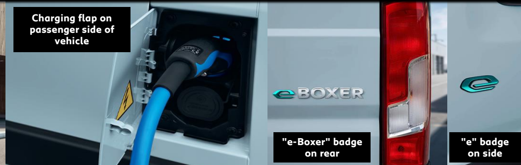
"e-Boxer" badge on rear

Charging flap on passenger side of vehicle