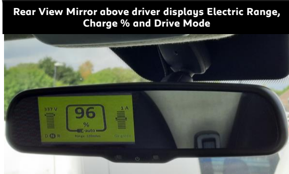
Rear View Mirror above driver displays Electric Range, Charge % and Drive Mode