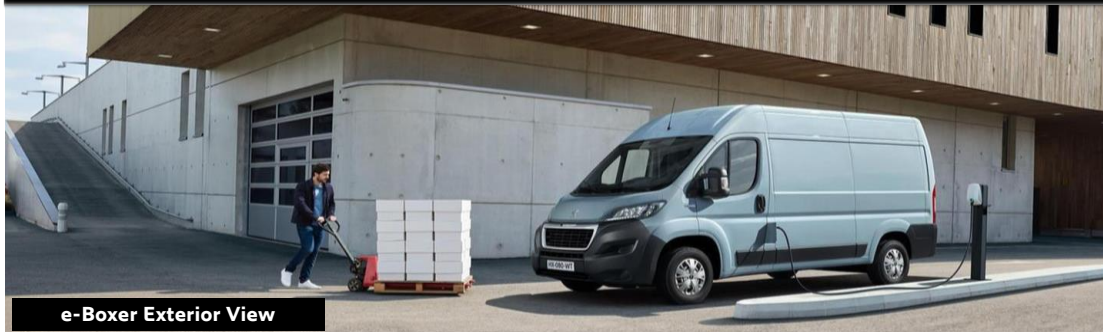
e-Boxer Exterior View

Charging flap on passenger side of vehicle