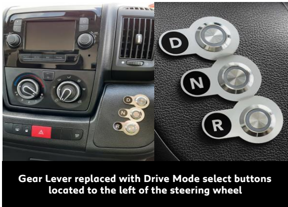
Gear Lever replaced with Drive Mode select buttons located to the left of the steering wheel