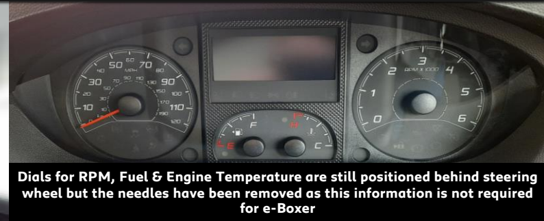
Dials for RPM, Fuel & Engine Temperature are still positioned behind steering wheel but the needles have been removed as this information is not required for e-Boxer