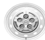
33, 35 Panel and Crew Vans