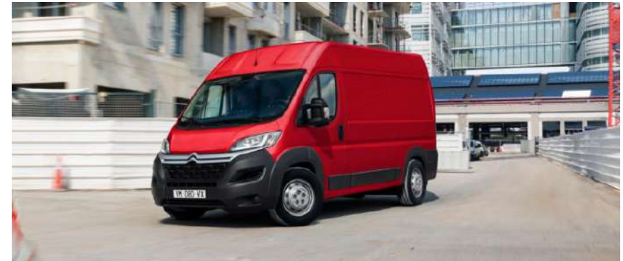
Electric Display in Rear Mirror: displays information including battery charge level and range

e-Relay is also compatible with 100kW chargers but will only charge at a maximum rate of 50kWh.