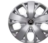
40 Panel/ Window Vans