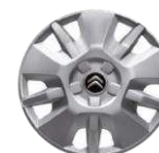
33, 35 Panel Vans