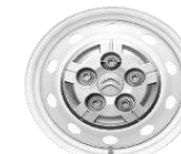
40 Panel/Window Vans